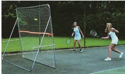
GTC 2 tennis trainer