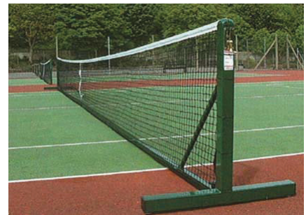
Portable steel posts