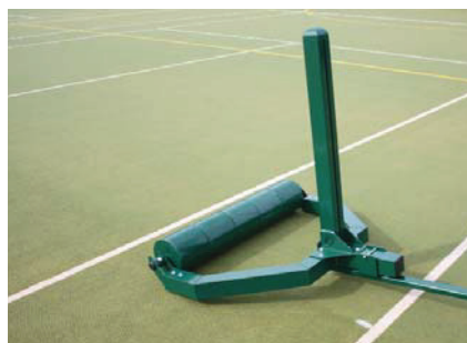
Steel tow bar detail