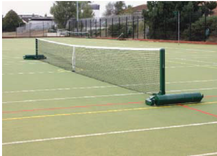
Integral weighted tennis posts