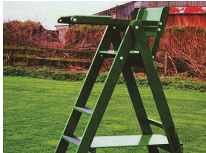
Wooden umpires chair

Extension pieces To raise socket height for court resurfacing (to fit square 76mm posts) OSE-T1498