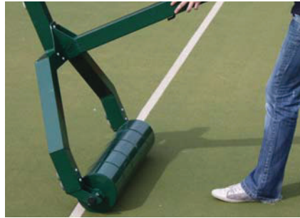
Integral weighted post and base detail