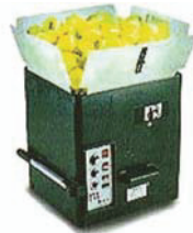
Tennis tutor plus 4

For indoor use, random oscillator holds 250 balls.