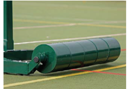
Integral weighted roller detail