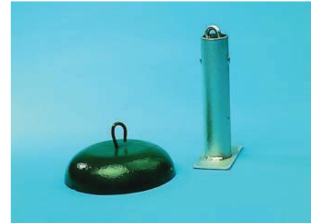
Ground weight and plunger

Stand to suit manual scoreboard TCE-S0910