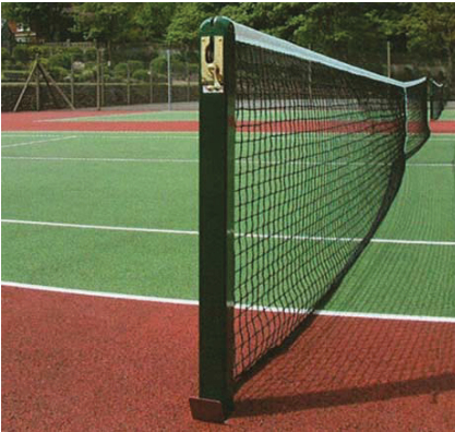
Ground socketed steel posts