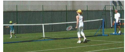
Mini tennis practice