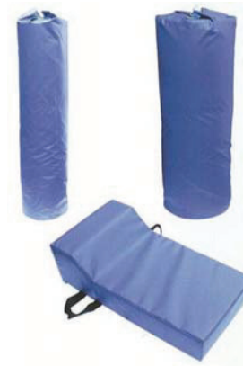
Tackle and rucking pads

For portable UPVC mini rugby posts OSE-R1454