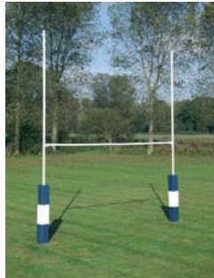
Heavy duty posts