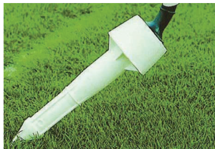
Spring back corner poles