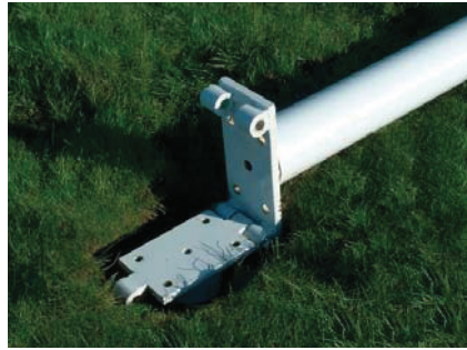
Hinged posts detail