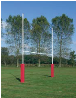
School standard posts