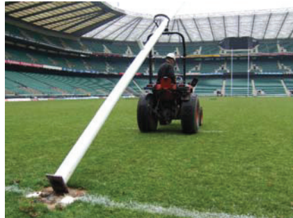
Assembly roller in use