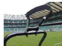
Assembly roller detail