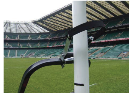
Assembly roller detail