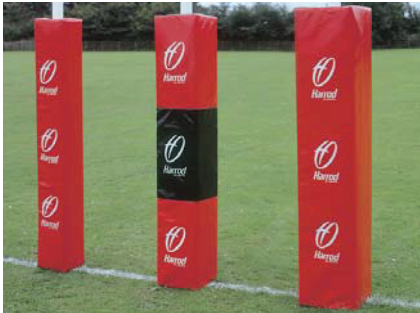
Rugby post protectors