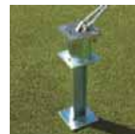
Flip up style anchor socket

Comprises a 17kg handbag style portable weight complete with covered chain, carbine clip and 'U' type bracket to fit up to 43mm diameter back tubes. OSE-F1206