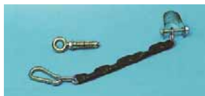
Wall fixed chain anchor