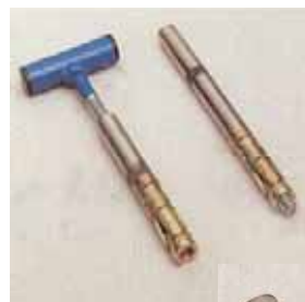
General sports posts