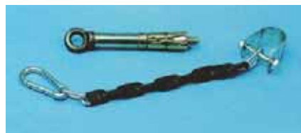
Floor fixed chain anchor