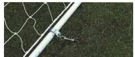
Standard turf anchor