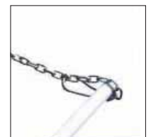
Fence type anchor