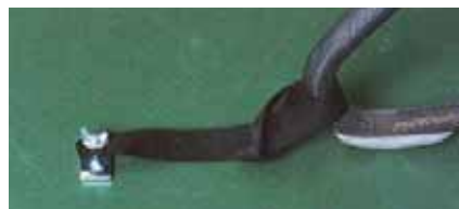
Floor/wall strap anchor

Suspended floors - floor socket variable, but maximum depth 185mm. ISE-F0330