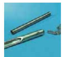
Tarmac type ground anchor