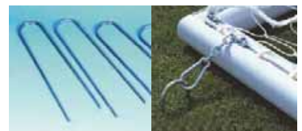
U-peg ground anchor