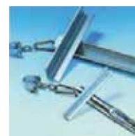
Heavy duty turf anchor