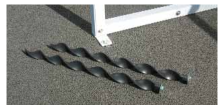
Spira lock anchor kits