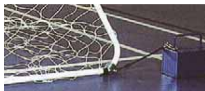
Indoor counterbalance anchor weight