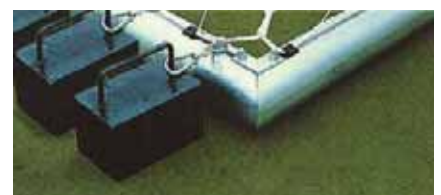
Standard outdoor counterbalance anchor weight